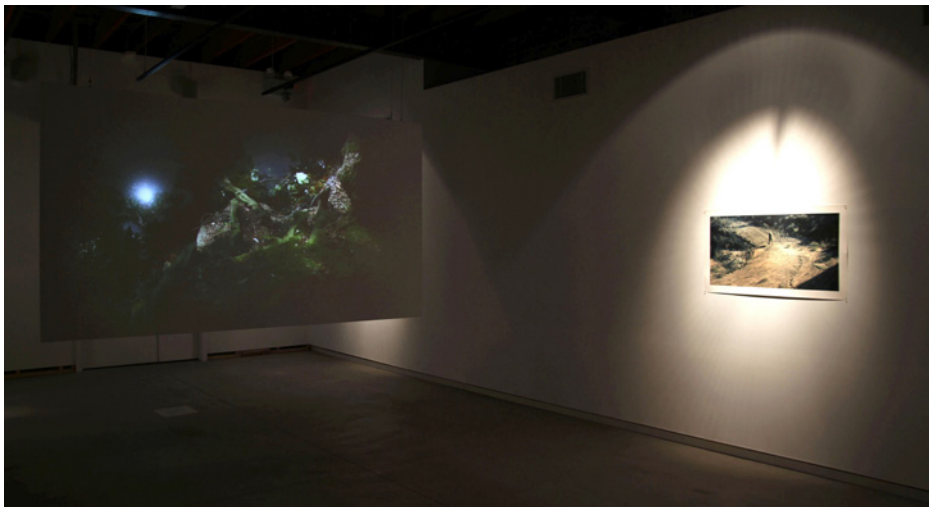
Hold (2010) Exhibition Detail (Eloise Calandre (2010) Cradle and David Mutch (2009-10) Untitled #10 ).

David Mutch's single photographic image Untitled #10 from The Tourist series (2009 - 2010) depicts a carefully framed landscape marked by deep shadows and a washed-out colour palette. The landscape provides a background on which a single figure walks along a desolate unsealed road. Just as Yardley's work suggests narratives beyond the frame, this image speaks of the road travelled and the road yet to be travelled. This presumed