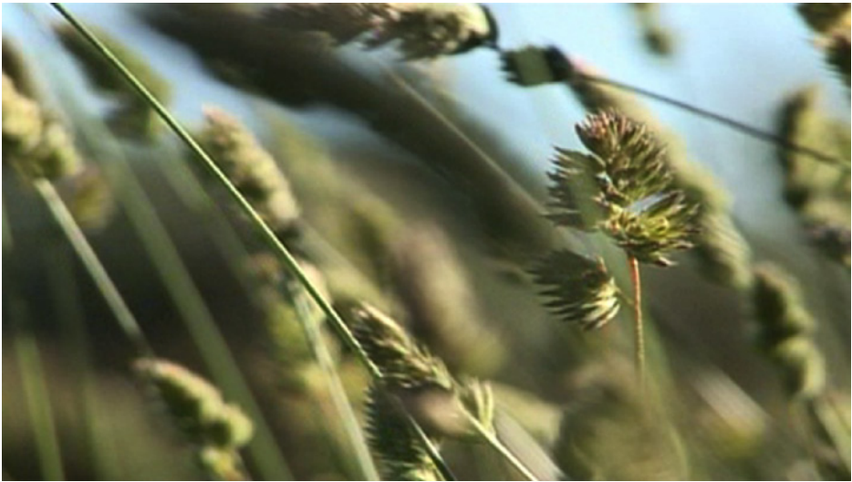
Scott Morrison (2009) oceanechoes , Video Still.

achieved through editing, rather than literally revealing the still image at cinema's base.