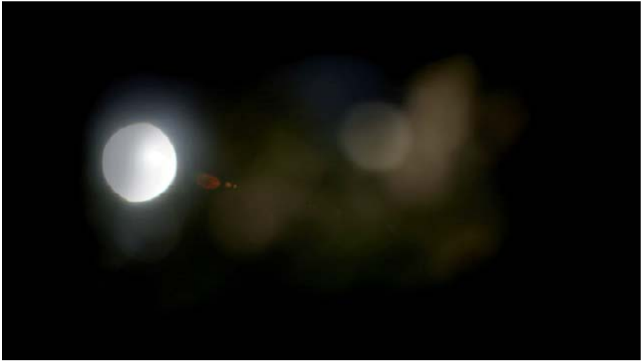
Eloise Calandre (2010) Cradle , Video Still.

specifically visual about this kinetic change. The effect is not only perceived visually, but it reproduces an effect of the human eye.