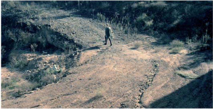
David Mutch (2009-10) Untitled #10 from the series The Tourist , Photograph.

Untitled #10 oscillates between photography and cinema, and in so doing reproduces the tension between stillness and motion at the heart of the moving image. The still photogram, which comprises all moving images, is erased by the projector's motion when viewed at twenty-four frames a second. Furthermore, the materiality of the image is erased in cinema as the sequence of stills is projected in motion.