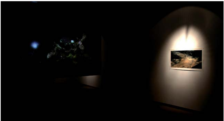
Hold (2010) Exhibition Detail (Eloise Calandre (2010) Cradle and David Mutch (2009-10) Untitled #10 ).

David Mutch's single photographic image Untitled #10 from The Tourist series (2009 -2010) depicts a carefully framed landscape marked by deep shadows and a washed-out colour palette. The landscape provides a background on which a single figure walks along a desolate unsealed road. Just as Yardley's work suggests narratives beyond the frame, this image speaks of the road travelled and the road yet to be travelled. This presumed narrative, evoked here in a photograph with a 16:9 cinematic ratio and carefully constructed aesthetic, suggests a cinematic freeze frame.