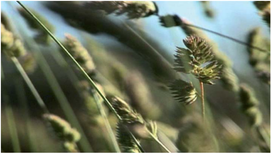
Scott Morrison (2009) oceanechoes , Video Still.

Despite the movement of the camera, its subject and editing, the constant focus on the grass at a continuous focal depth creates an overarching stasis within the otherwise moving video. oceanechoes expands the frame of the still image in order to include movement, yet the fixed gaze resists progression beyond the rhythms of the edits and soundtrack. So, when the video swings from the frenetic to the pensive, it seems as though these different facets are expanded elements of the same image and the video appears once again to be simultaneously moving and stationary.